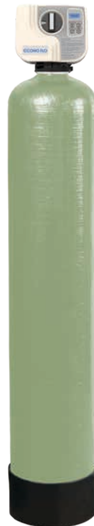
AIO (Air Induction Oxidizer) Chemical Free Iron Filter (Single Tank)

The filter is fitted with an inlet check valve to prevent any air from flowing backwards out of the filter tank.