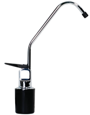
Standard chrome faucet included. Designer faucets available.