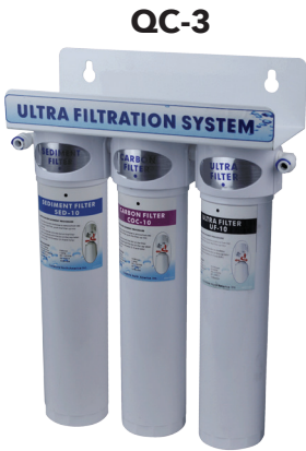
11.8" w x 4.5" d x 14.3" h