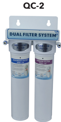
6.3" w x 3.9" d x 13.4" h