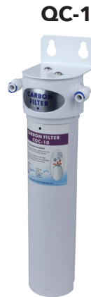
2.8" w x 3.2" d x 12.4" h